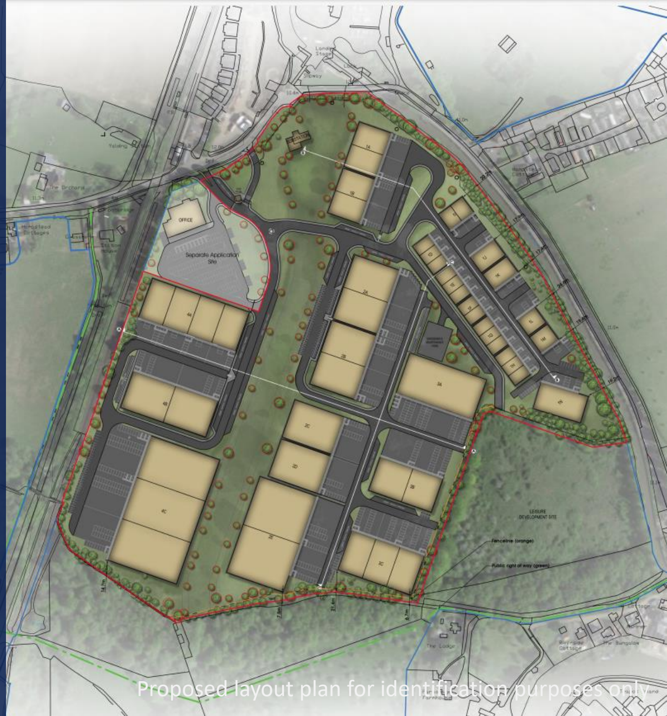
Proposed layout plan for identification purposes only

Amenities are available locally with the Boathouse pub immediately to the south and a village store, additional pub & eateries and doctors surgery in Yalding Village (approx. 1 mile east). Supermarket facilities are available in Paddock Wood (Waitrose) with a wider range of amenities available in Maidstone, Tunbridge Wells and Tonbridge.